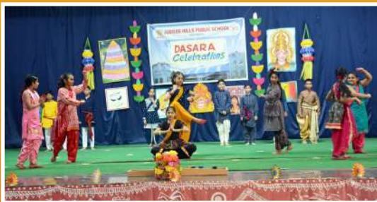
Garba Dance performance by Primary students