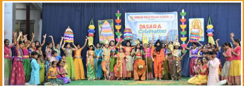
Secondary students performed on the importance of Dussehra festival