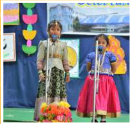
Tiny tots speech on significance of Batukamma and Dussehra

The special assembly began with a prayer song & speech by tiny tots about the significance of the festival. The highlight of the program was the 'Garba Dance' by Primary children which is one of the dance forms of North India. Pre-Primary children presented a dance drama which depicted how Lord Rama killed Ravana and liberated his wife Sita. Tiny tots wore colourful ethnic wear and presented Bathukamma and Dandiya Dance in a graceful manner.