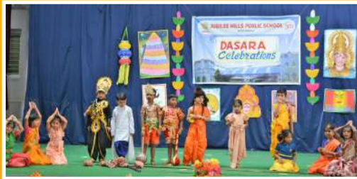
Pre primary children replicated a dance drama on Yudha Kanda of Ramayana