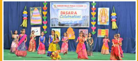
Batukamma, Dandiya dance by Pre Primary kids