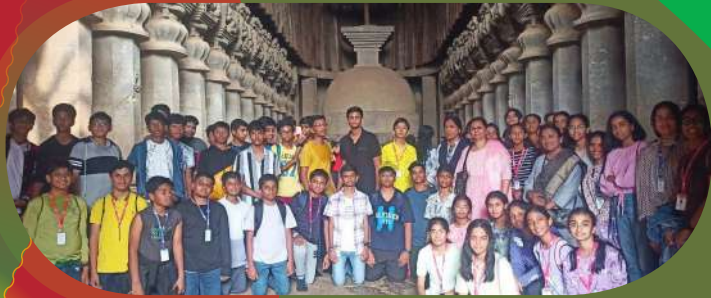
>>>>> Class VIII Excursion to Vizag, Araku Valley