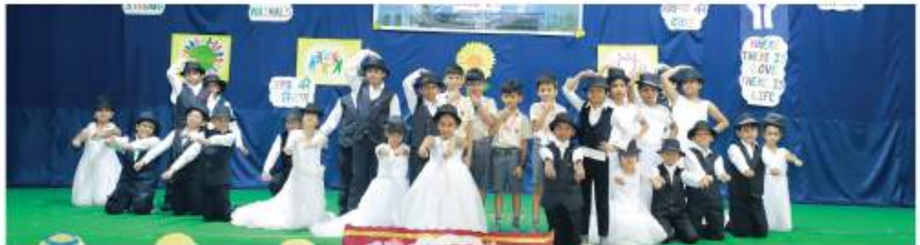
Your Life is My Life