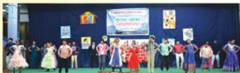
Celebrating the Birth of Jesus Christ