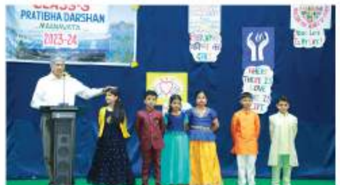
Special Appreciation for Children by the President