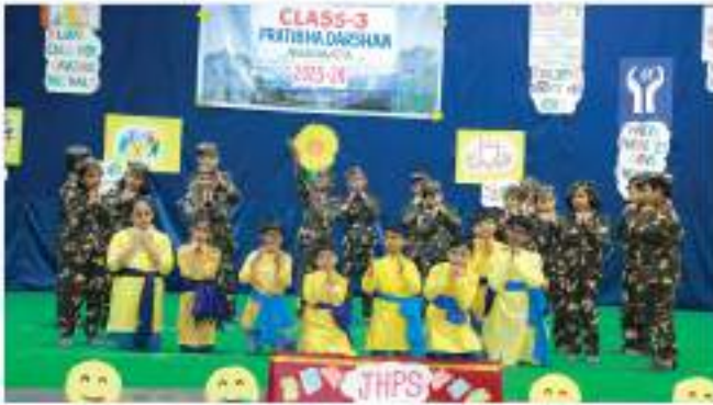
Asha ki Kiran