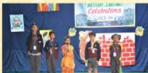
Fun With Math