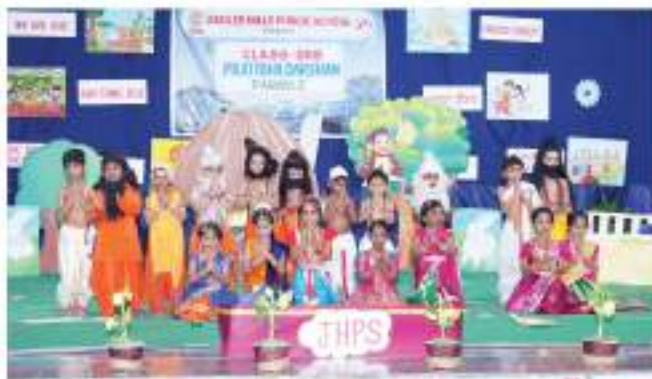
Welcome Address by Tiny Tots