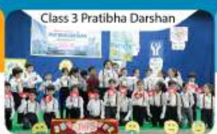
Class 3 Pratibha Darshan