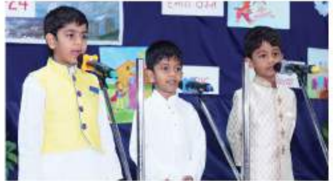
Kiddos Addressing the Audience