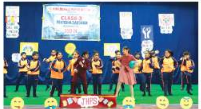
The Attribute Of Strength