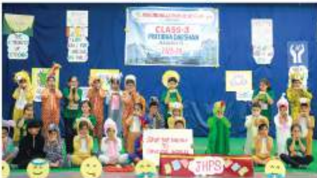
A Loud Call for Saving Animals