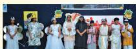
Depiction - Birth Of Jesus Christ