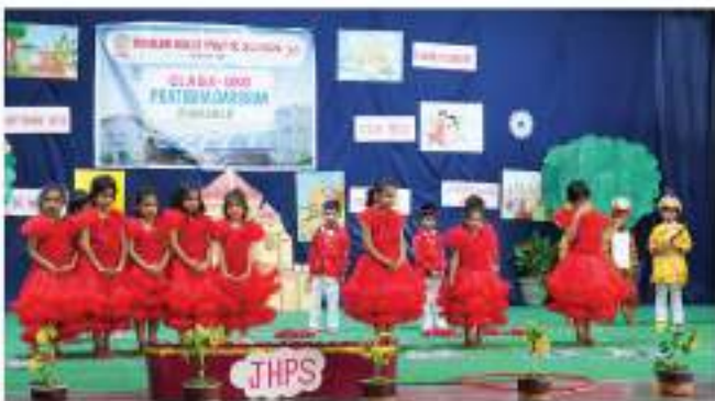
Finale – Rhythmic Rise