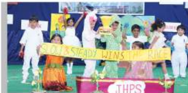
We are One!