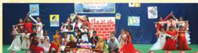
Merry Christmas Dance by Primary Students