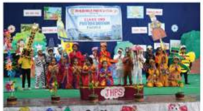
Magic of Puppetry