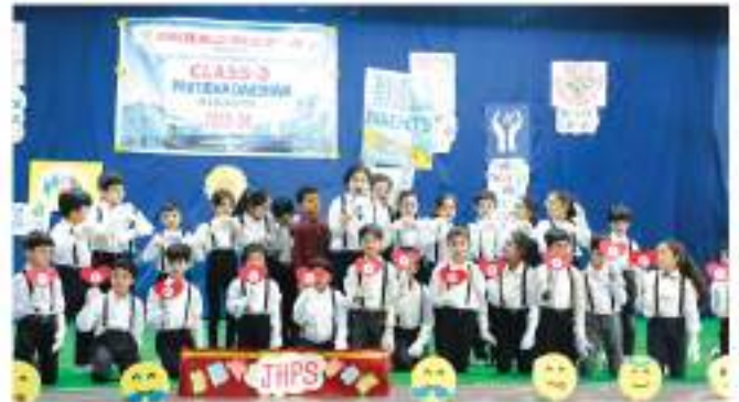
Where There is Love There is Life