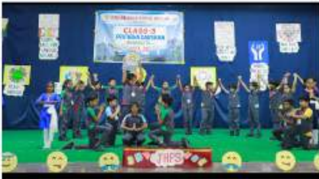
Shiksha Aap Ke Bavishya Ka Dwaar