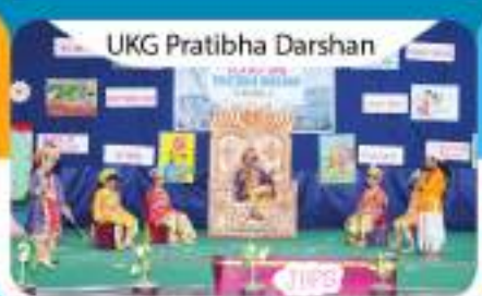
UKG Pratibha Darshan