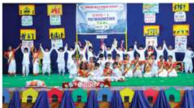
Ek La Chalo Re