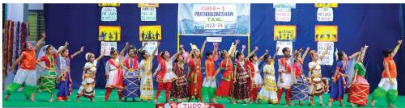
Finale – Feel India