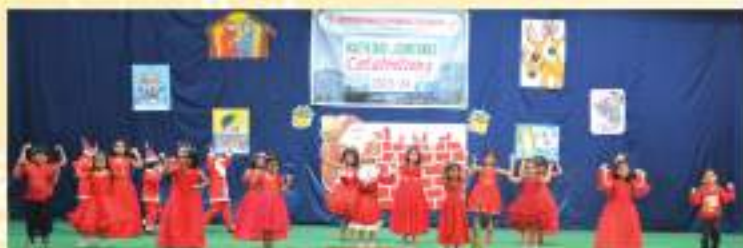
Jingle Bells Dance Performance by tiny tots

National Math Day was also celebrated to mark the birth anniversary of the great Mathematician, Srinivasa Ramanujan. The importance of Mathematics in daily life was brought out in a fun way through riddles and puzzles.