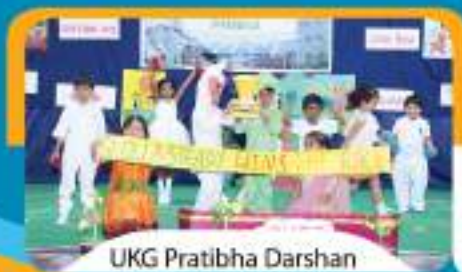
UKG Pratibha Darshan