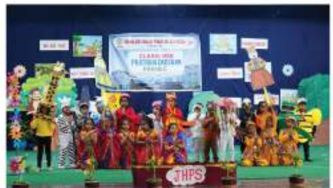
Magic Of Puppetry