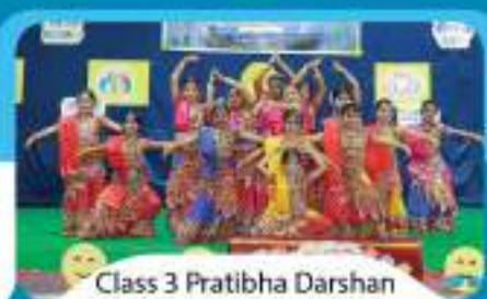
Class 3 Pratibha Darshan