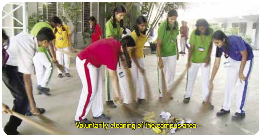
Voluntarily cleaning of the campus area

As part of the campaign for Swachh Bharat- the School observed Swachhta Pakhwada from 1 st to 15 th September, 2018 to create awareness among the students regarding Cleanliness and the ongoing cleanliness drive "Swachh Bharat" started by our respected Prime Minister, Shri Narendra Modi.