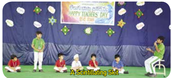
A Scintillating Skit