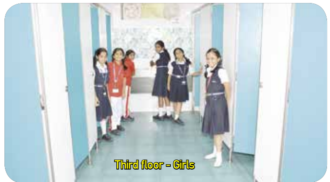
Third floor - Girls