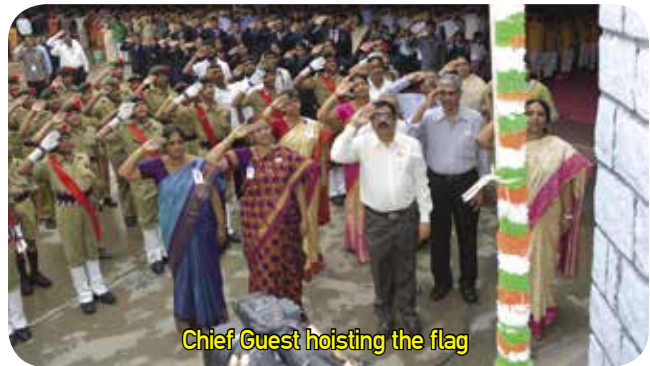
Chief Guest hoisting the flag