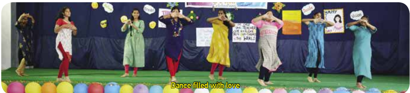
Dance filled with love