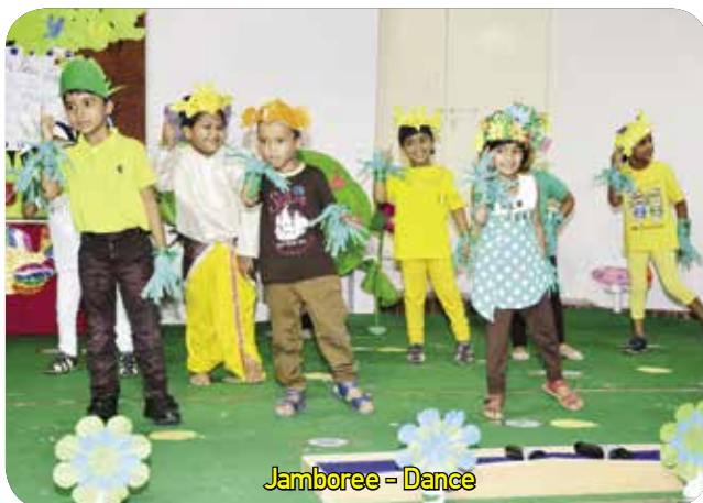
Jamboree - Dance