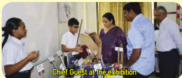
Chief Guest at the exhibition