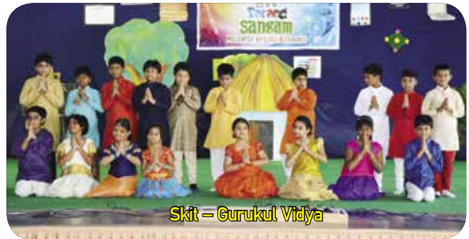
Skit – Gurukul Vidya