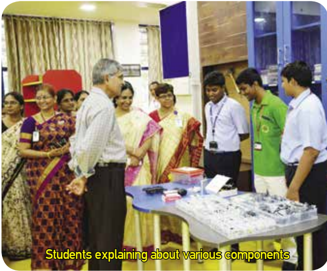
Students explaining about various components