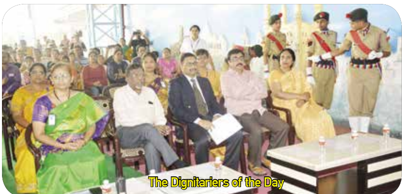
The Dignitaries of the Day

symbiotic relationship from the epic Mahabharata. He reiterated that a great leader is one who doesn't demand respect but commands it through his ethics, morals and strives for excellence