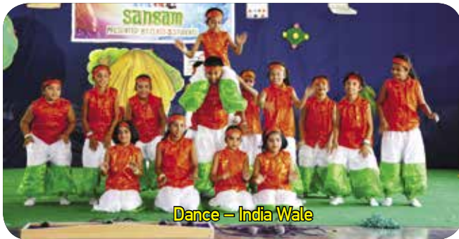
Dance – India Wale