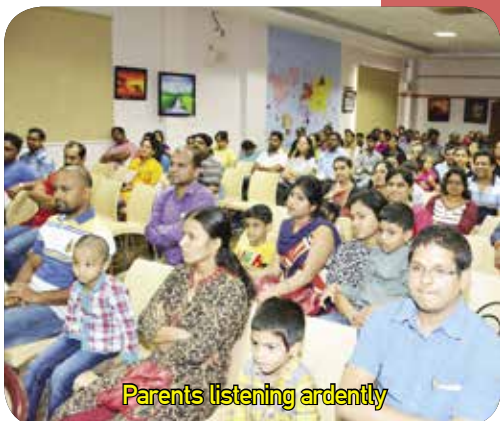
Parents listening ardently