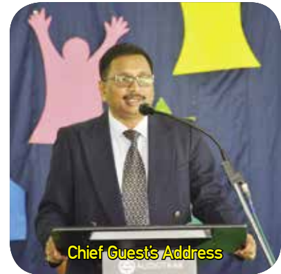
Chief Guest's Address