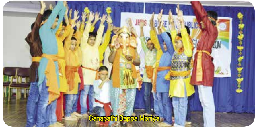
Ganapathi Bappa Moriya