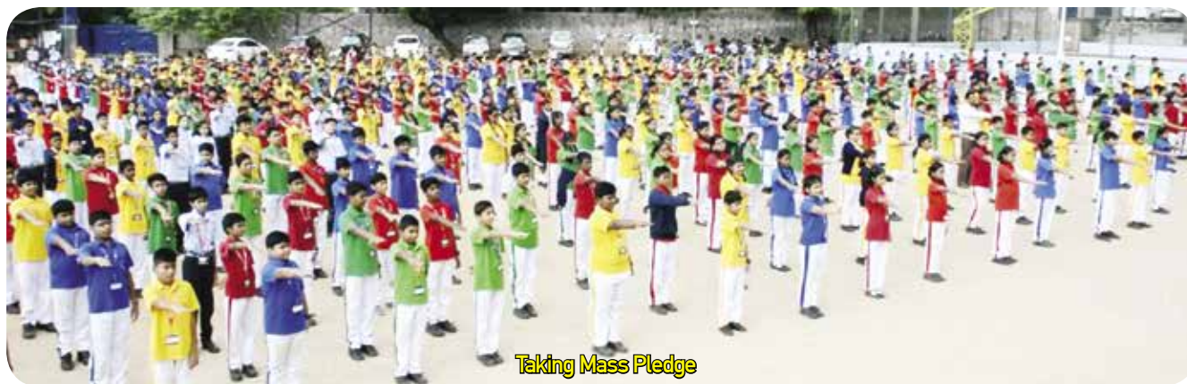
Taking Mass Pledge

The entire event was a huge success and it portrayed the words 'Purity of mind and cleanliness of land go hand in hand towards the building of an ideal nation beautifully.