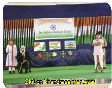
Skit on Chandrasekhar Azad