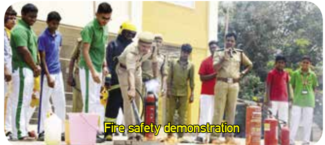
Fire safety demonstration