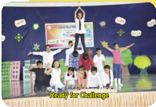
Ready for Challenge