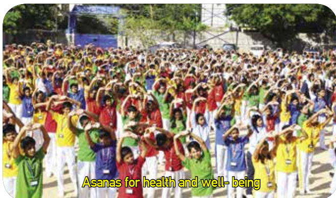
Asanas for health and well-being