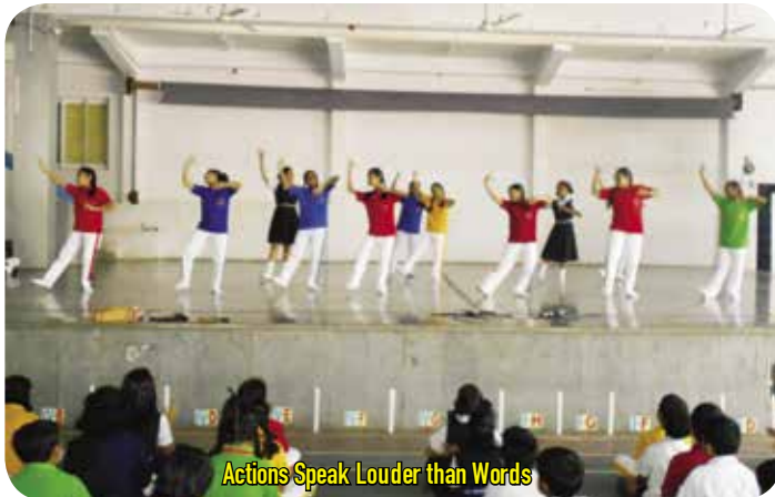
Actions Speak Louder than Words