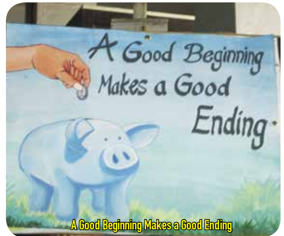
A Good Beginning Makes a Good Ending

Each and every student is given an opportunity to participate and showcase their talents and in turn learn to become a leader of tomorrow.