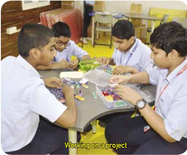
Working on a project