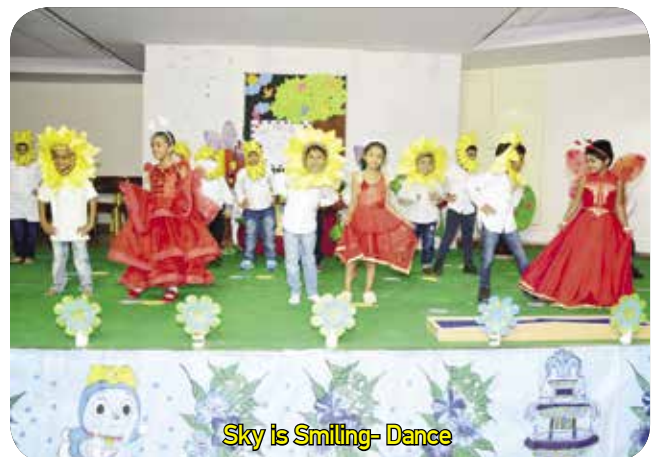
Sky is Smiling - Dance