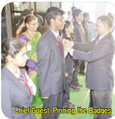
Chief Guest Pinning the Badges

Addressing the gathering, the Chief Guest congratulated the