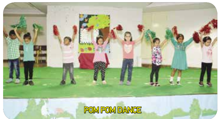
POM POM DANCE