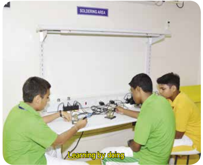
Learning by doing