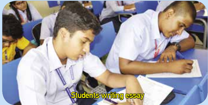
Students writing essay