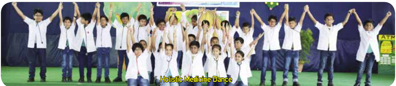
Holistic Medicine Dance