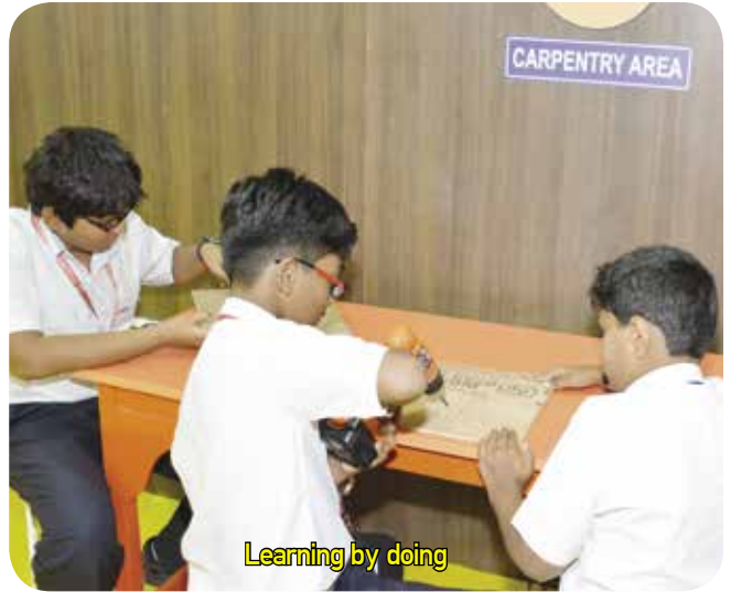
Learning by doing