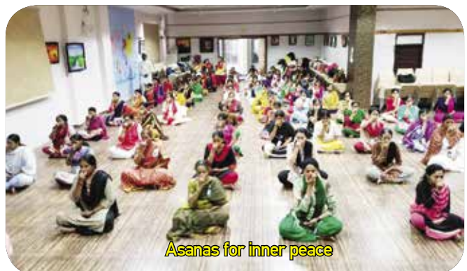
Asanas for inner peace