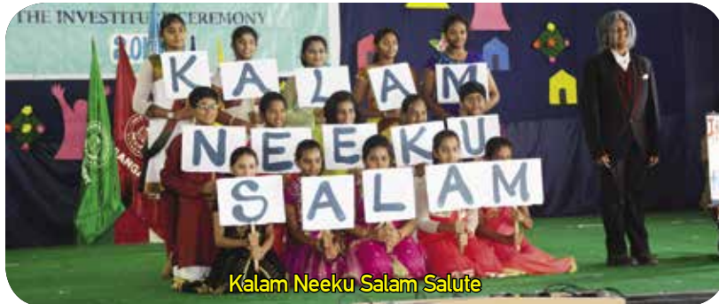
Kalam Neeku Salam Salute