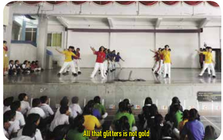
All that glitters is not gold