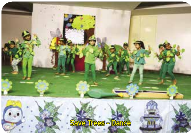
Save Trees - Dance

The parents were happy to see their children giving such a wonderful performance on the stage.