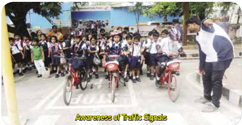
Awareness of Traffic Signals

The trip was very informative and gave a practical experience of the theory which the children learnt at school.