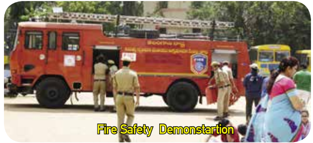
Fire Safety Demonstration

A fire truck with hose pipes was brought into the school campus. The team also showed the methods to extinguish fire by using water. They also explained how to evacuate the building when it is on fire and advised the students to use the stairs instead of lift. The session was informative and educational.