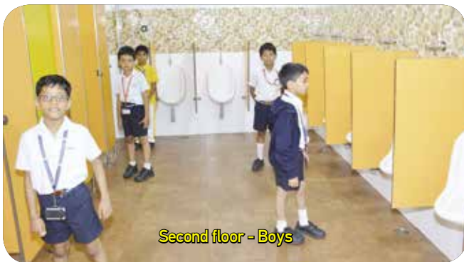
Second floor - Boys

W ith renewed focus on student's health and hygiene, the latest washrooms were constructed with international standards. A total amount of 75 Lakhs was spent to provide students with modern washroom facilities, keeping the students health as priority.