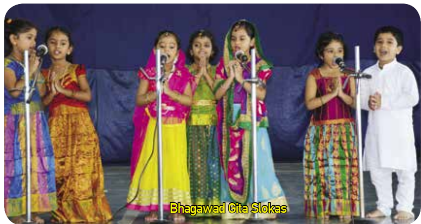
Bhagawad Gita Slokas

The highlight of the programme was Dahi Handi where our tiny tots dressed in Krishna's attire tried their best to reach the Dahi Handi. All the students had fun and left the premises with festive fervor.