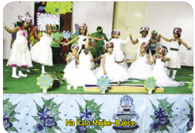
Na Kato Mujhe - Dance