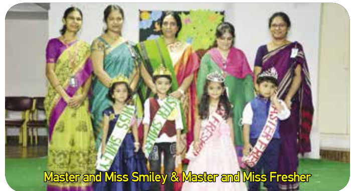
Master and Miss Smiley & Master and Miss Fresher