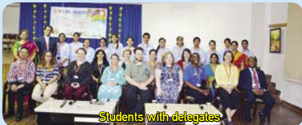
Students with delegates