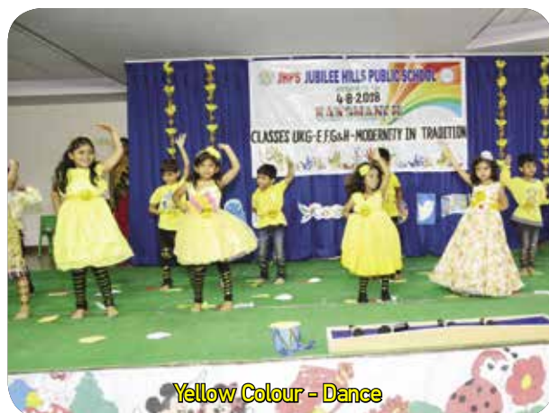
Yellow Colour – Dance