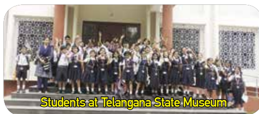
Students at Telangana State Museum

The students enjoyed their field trip and they made a note of each antiquity to share the knowledge with their friends. Overall, it was a wonderful experience for the students.