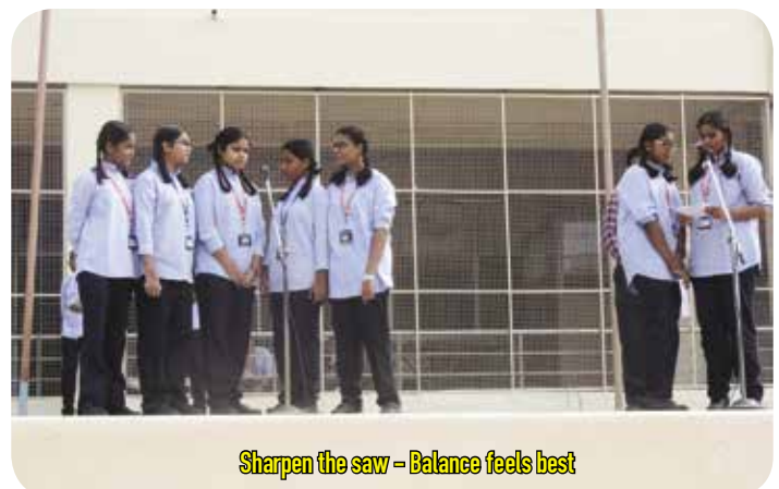
Sharpen the saw - Balance feels best