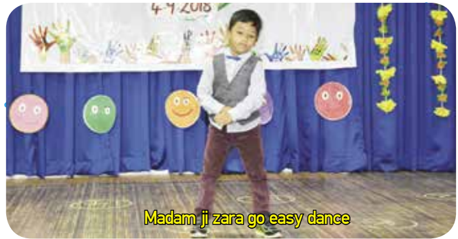
Madam ji zara go easy dance