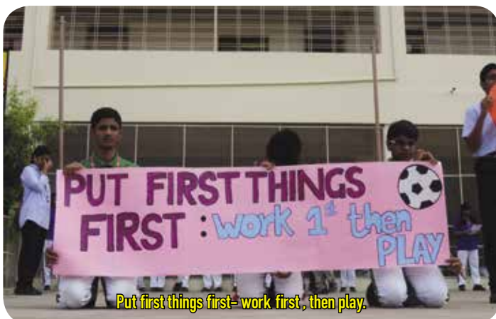
Put first things first- work first , then play.