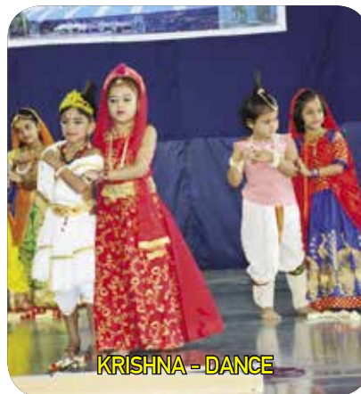
KRISHNA - DANCE