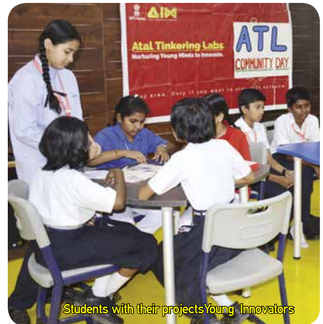
Students with their projects Young Innovators