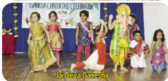
Jai Deva Ganesha