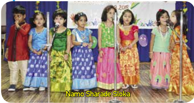
Namo Sharade Sloka