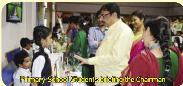
Primary School Students briefing the Chairman

The exhibits provided a platform to scientific experimentation and innovation to the future scientists. The exhibition was an excellent way to teach not just the students but everybody about science and ways in which they can conserve the resources.