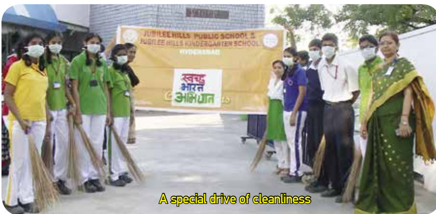
A special drive of cleanliness

With an aim to achieve the Prime Minister's goal the students and teachers of the school took pledge "I will remain committed towards cleanliness and initiate the quest for cleanliness with myself, my family, my locality, my village and my work place. I will endeavour to make everyone devote their 100 hours for cleanliness. I am confident that every step I take towards cleanliness will help in making my