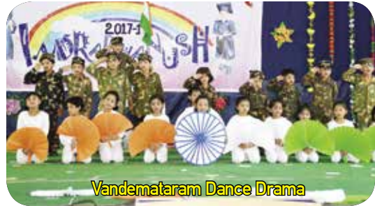
Vandemataram Dance Drama

The programme came to an end with the vote of thanks and the National Anthem.