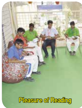
Pleasure of Reading