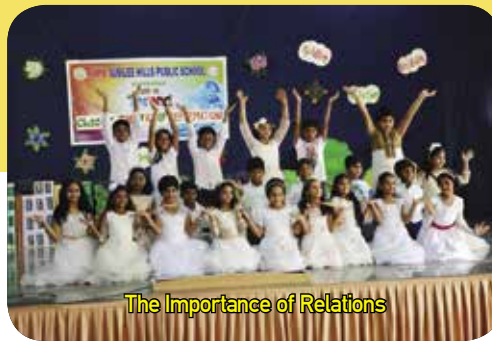
The Importance of Relations