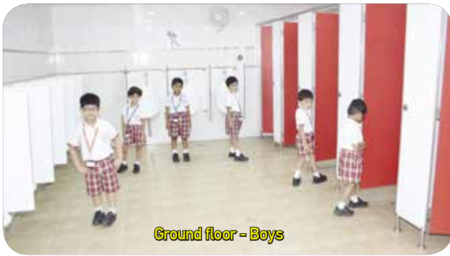
Ground floor - Boys