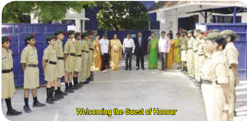
Welcoming the Guest of Honour