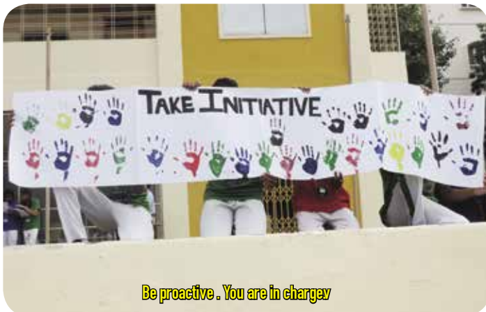
Be proactive . You are in chargey