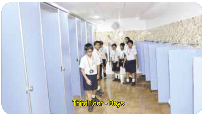
Third floor - Boys