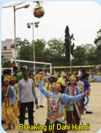
Breaking of Dahi Handi