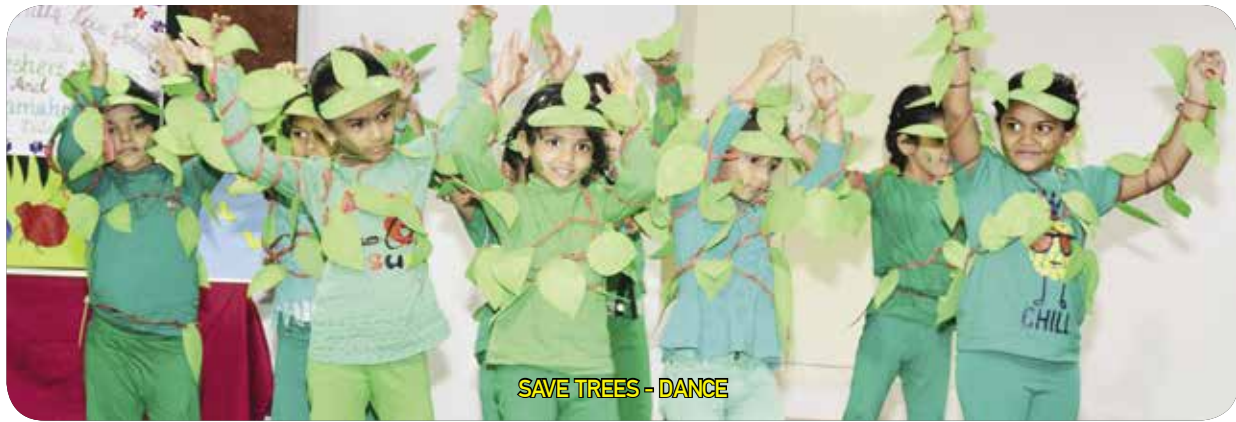
SAVE TREES - DANCE