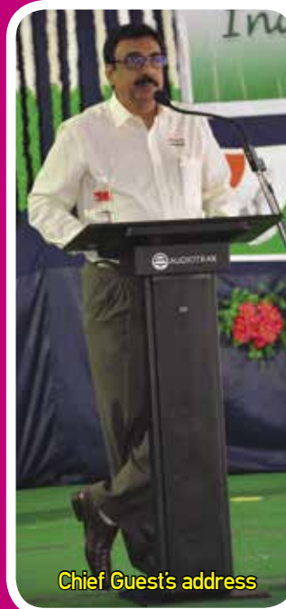
Chief Guest's address