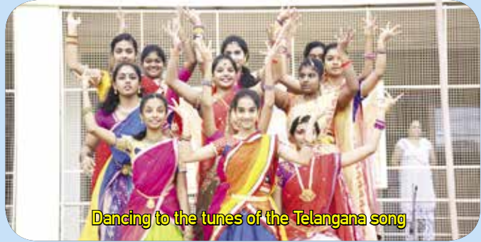
Dancing to the tunes of the Telangana song