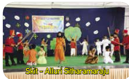
Skit - Alluri Sitharamaraju