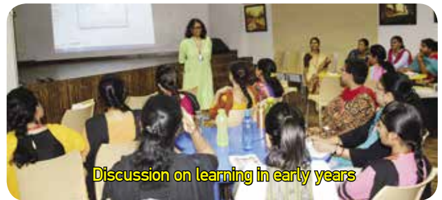
Discussion on learning in early years