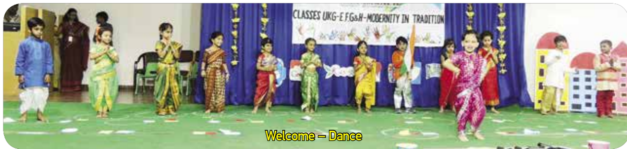
Welcome – Dance