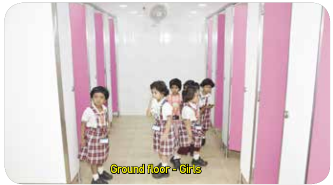
Ground floor - Girls