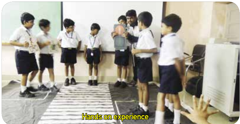
Hands on experience