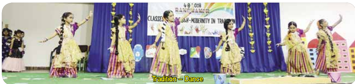
Tradition – Dance