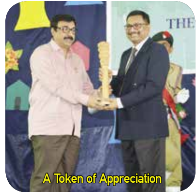
A Token of Appreciation

in all things he does. He said that the teachers are the first leaders in a student's life. He said that a leader should set a bench mark through his traits like humility, modesty, integrity, courage, cooperation and has to have telescopic, microscopic, periscopic and stethoscopic views.