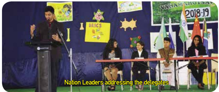
Nation Leaders addressing the delegates

JHPS chose 10 committees namely, Agriculture, Outer Space, Internet Governance and Security, Business Forum and Council,