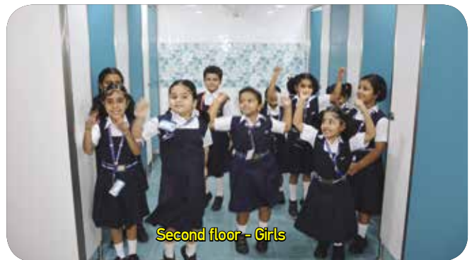
Second floor - Girls