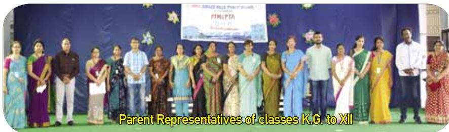
Parent Representatives of classes K.G. to XII

The Parent Representatives for classes LKG to XII were elected and few parents will be the representatives in the School Managing Committee (SMC), Safety, Grievance, Sanitation, Transport, Discipline and External Competition Committee for this academic Year.