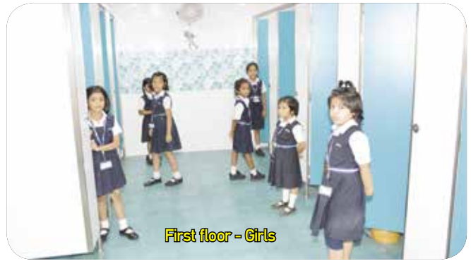
First floor - Girls