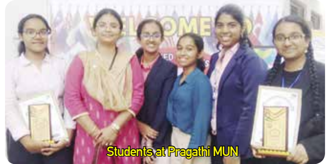
Students at Pragathi MUN