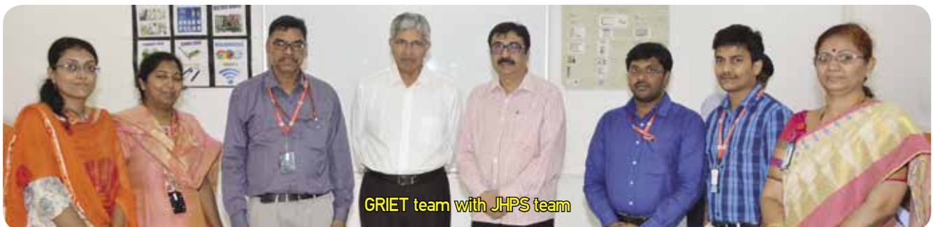
GRIET team with JHPS team