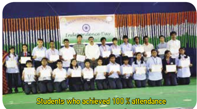
Students who achieved 100% attendance