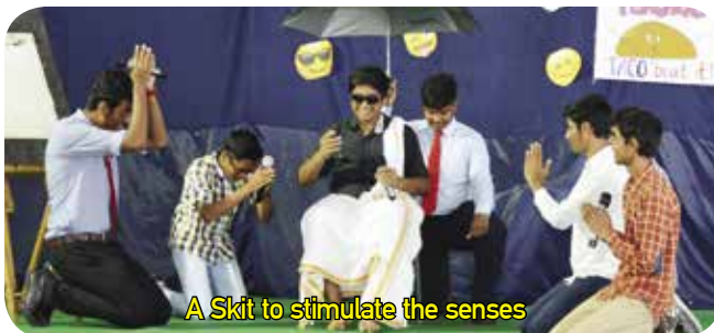
A Skit to stimulate the senses