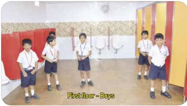
First floor - Boys